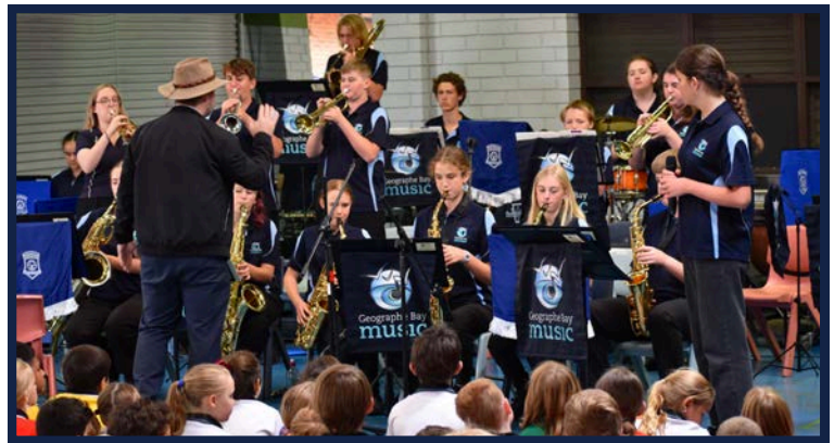
GEOGRAPHE PRIMARY SCHOOL